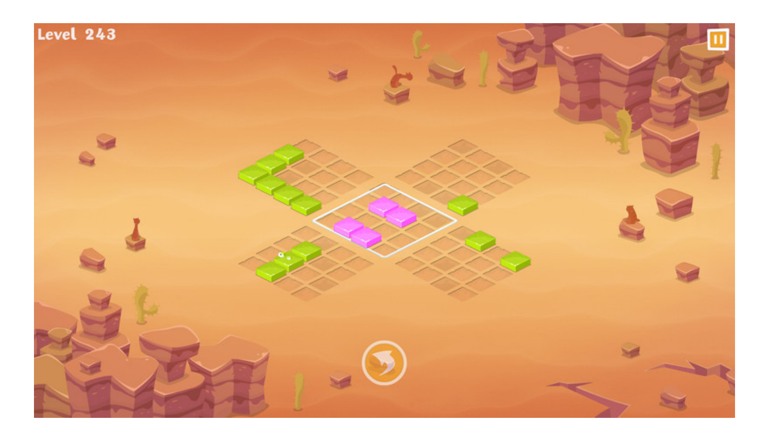
Perfect Fit - Totemland Download Bittorrent

Download >>> <a href="http://bit.ly/2SJNkyr">http://bit.ly/2SJNkyr</a>